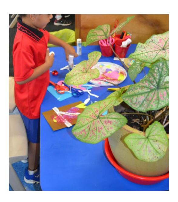
Learning is about the development of the whole child socially, emotionally, physically and academically.